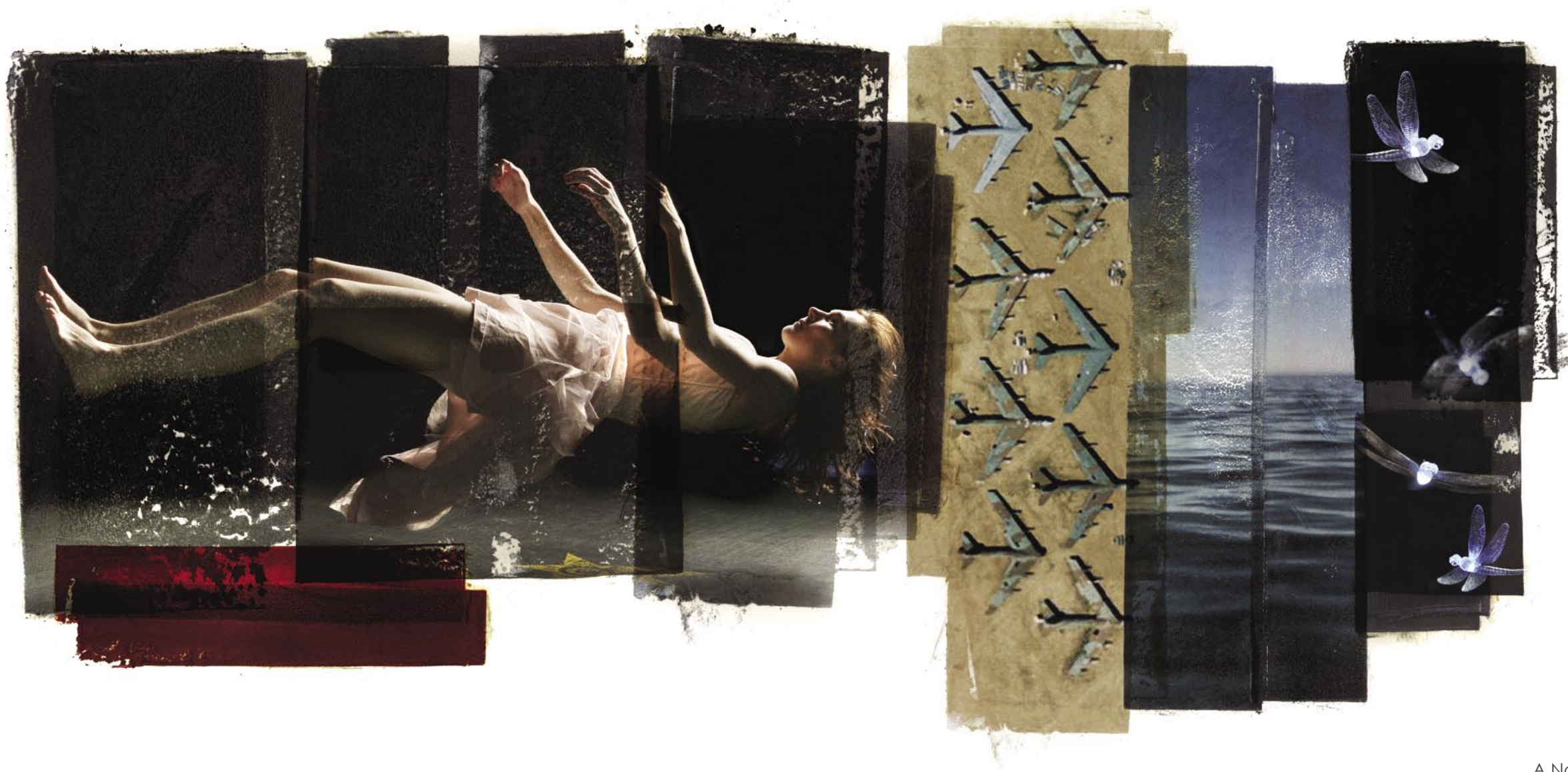
A Nation in Spiritual Deficit (trampoline) Digital print on William Turner 300g paper 224 x 106 cm / 47 x 54 in Edition of 15