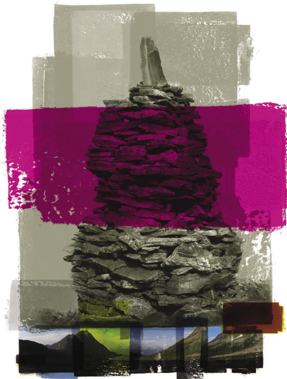
Opposite spread: Varde (Romsdalshorn) Digital Print on William Turner 300 gr paper 100 x 110 cm / 39 x 43 in Edition of 15