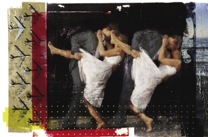
mms / metaphores / politics Photolitho on paper 70 x 50 cm / 27 x 20 in Edition of 60