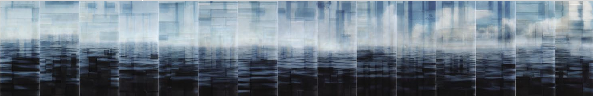
Split Sky / atlantic timeline