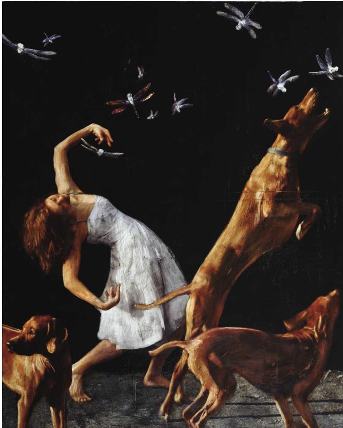
mms / metaphores /dragonfly II. Mixed Media / Oil on Canvas 162 x 203 cm / 64 x 80 in