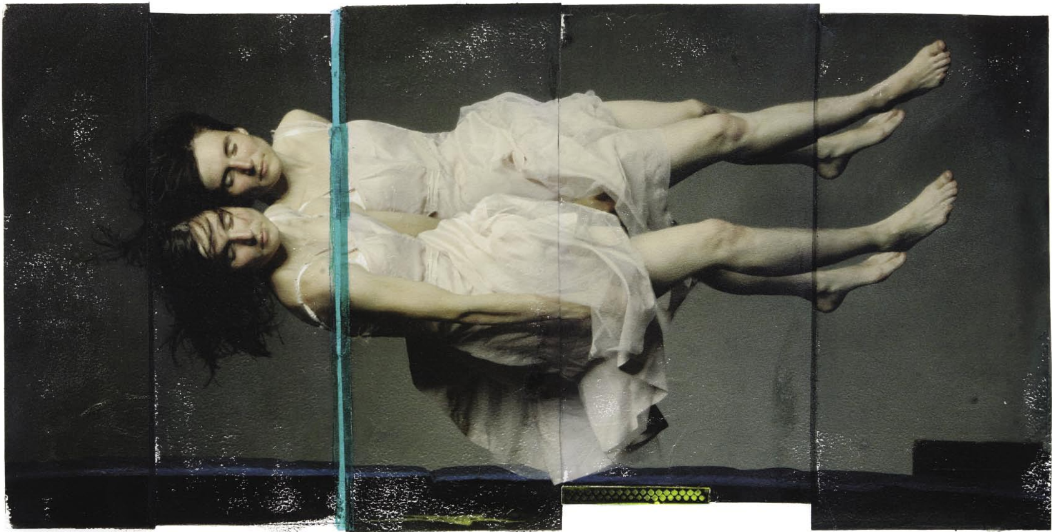
Conductivity / socialdemocratic channeling (trampoline) Mixed Media / Phototransfer on Paper 60 x 30 cm / 24 x 12 in