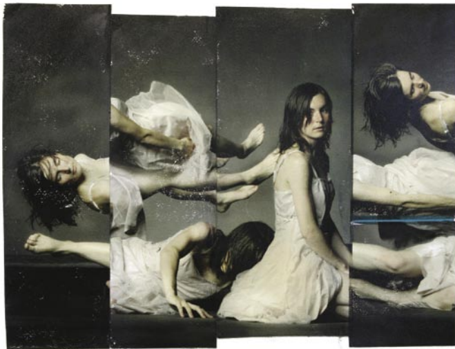
Reflex / faultline (trampoline) Mixed Media / Phototransfer on Paper 56 x 40 cm / 22 x 16 in