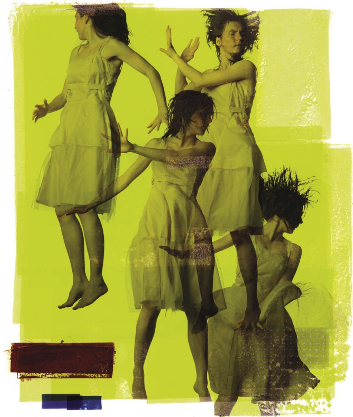
Opposite spread: Defense (trampoline) Digital Print / Phototransfer on Paper 100 x 110 cm / 39 x 43 in