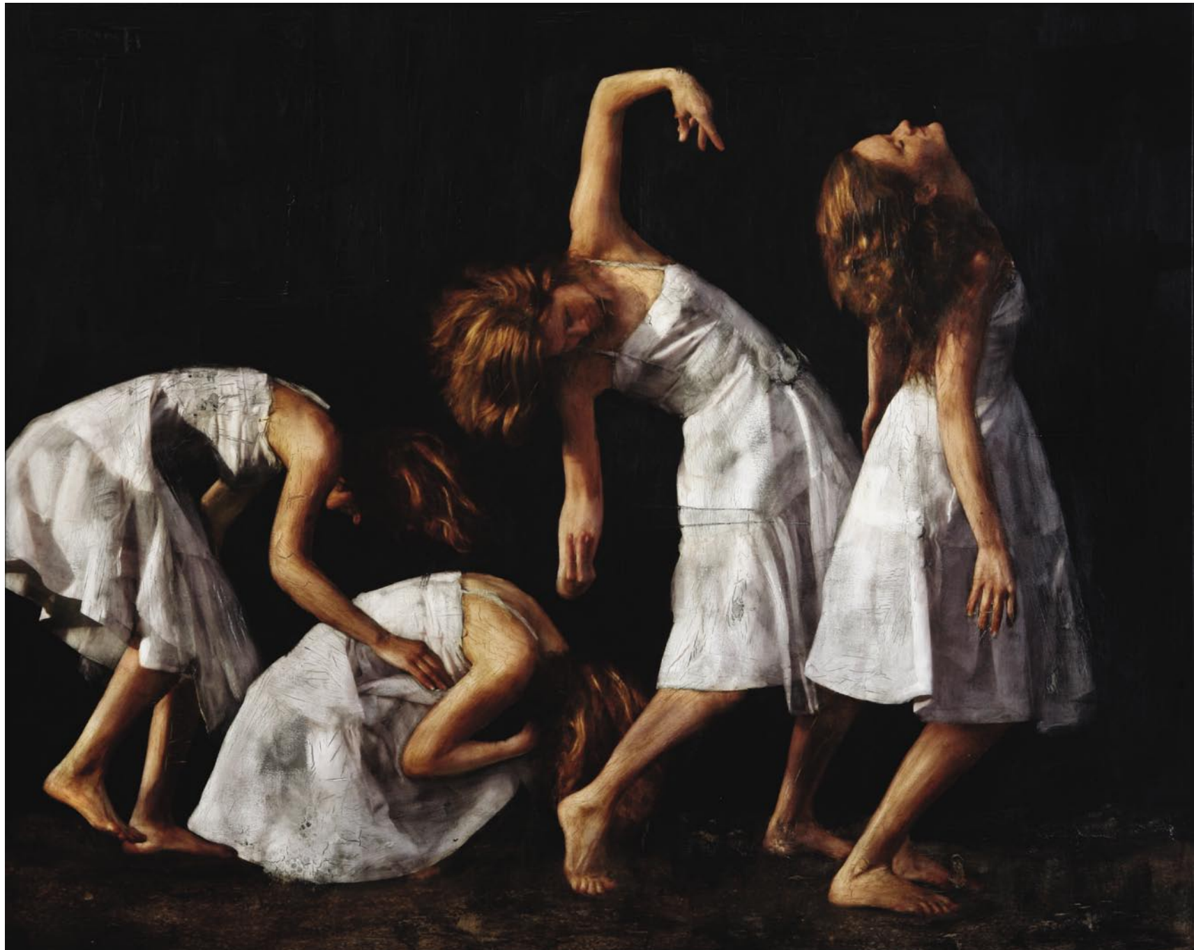
mms / metaphores / ritual Mixed Media / Oil on Canvas 200 x 160 cm / 79 x 63 in